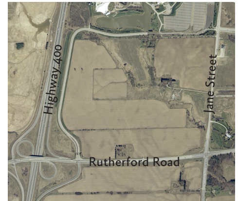
Vaughan Centre Site

Located in the City of Vaughan, this 75 hectare master planned community blends approximately 1500 residential units with a mix of housing types, as well as public and community focus uses, shopping areas, recreation facilities, employment opportunities and abundant open space areas sensitively integrated with the urban environment.